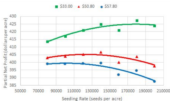
FIGURE 4. Seeding rate effect on net profit (yield x market price) based on three different seed costs (per unit of 140,000 seeds) and assuming a market price of $8 per bu (left) and $10 per bu (right), based on North Dakota data.