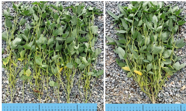
FIGURE 1. Soybean growth is affected by population. Soybean plants were harvested from a high (left) and low (right) plant population trial area. Note the number of branches, leaves, and seeds differ significantly on a per plant basis, but there is little difference in seeds produced on an area basis.

Soybean plants are incredibly flexible at adjusting to a wide range of plant populations (Figure 1). Soybean plants in low populations will produce more branches, more pods and more seeds per plant. Soybean at higher populations will grow taller, produce fewer branches, pods and seeds per plant. Because of this flexibility, soybean can often produce similar seed numbers per acre and similar yields over a wide range of plant populations. Perhaps because of this flexibility, along with experience of anticipated percent establishment, soybean producers in the Midwest report a wide range of seeding rates they use in the region (Figure 2)