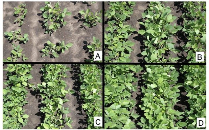
FIGURE 3. Light interception or canopy closure for four seeding rates (seeds/acre) planted in 20 inch rows. A. 25,000, B. 125,000, C. 225,000, D. 275,000.

Above-optimal PPD leads to tall and spindly plants that are more susceptible to lodging. High PPD may cause yields to decrease in low-rainfall environments because of drought stress. Yield losses due to excessive PPD are relatively rare and are most common when there is lodging or infection with diseases such as Sclerotinia stem rot (white mold).